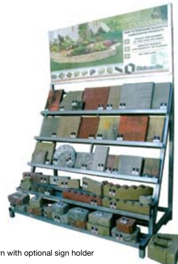
PD3006 shown with optional sign holder