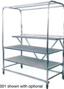
FB3001 shown with optional casters, expanded metal bench tops and basket tower