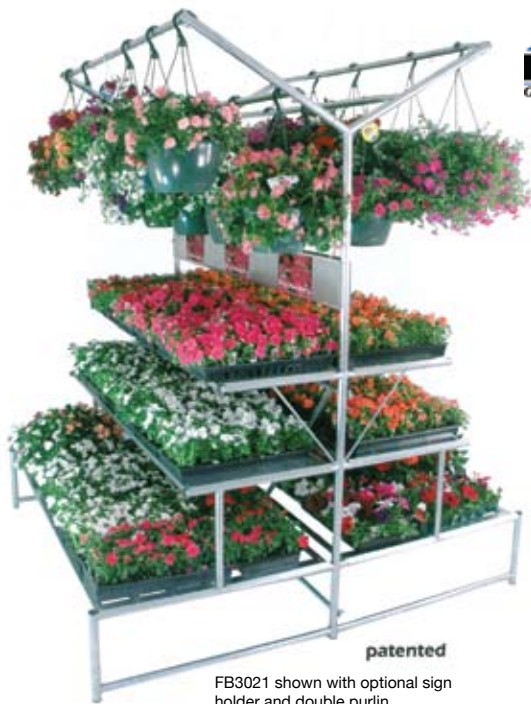
FB3021 shown with optional sign holder and double purlin