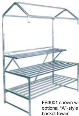
FB3001 shown with optional "A"-style basket tower