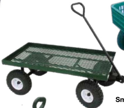
20x38W Small Metal Green Cart (20" x 38" deck)