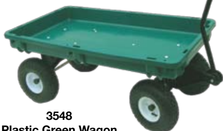
3548 Plastic Green Wagon (20" x 38" deck)