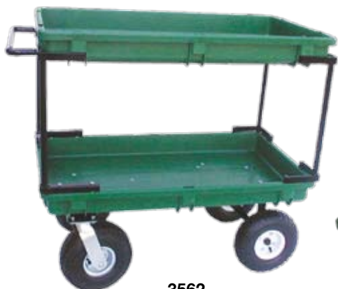
3562 Poly Green Double Deck Push Cart (20" x 38" deck)