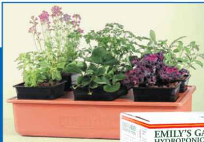
EMILY'S GARDEN SYSTEM