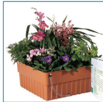
MEGA GARDEN SYSTEM